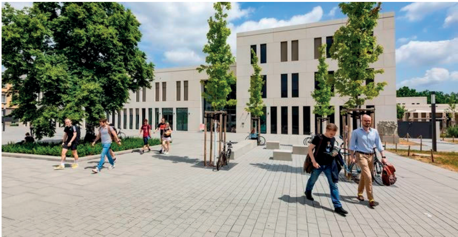
Leipzig University, Campus of the Faculty of Education, venue of the Centennial Conference 2026