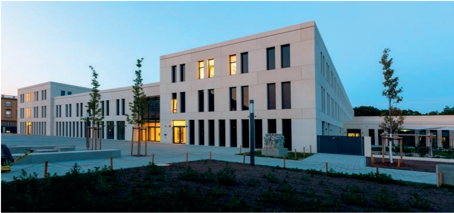
Leipzig University, Campus of the Faculty of Education, venue of the Centennial Conference 2026