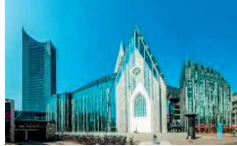
Leipzig University, Paulinum, venue for the opening ceremony of the ICHS-Centennial Conference 2026