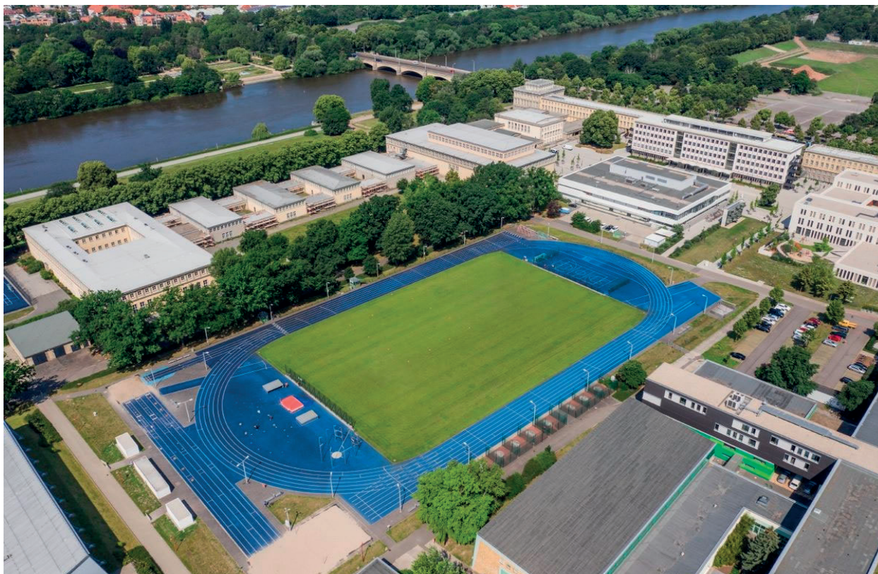
Aerial view of the Leipzig University's Campus for the Faculties of Sports and Education, venue of the Centennial Conference