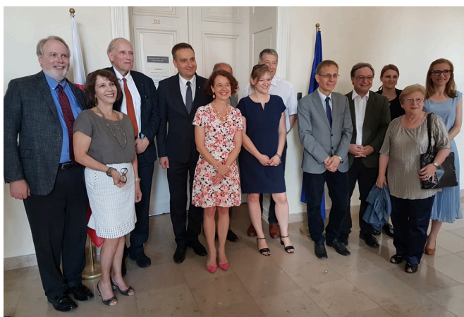
The CISH board at the reception with the mayor of Poznań