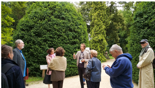
In one of Poznań's many parks

KAM: I think so. But the question of possible new applications is the responsibility of the CISH Board.